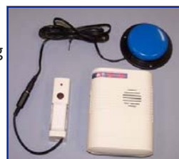
switch adapted door chime

A battery operated door chime is a low tech device often used by people living with MND so they can get the attention of someone else in their home. The door chime set comes in two parts; a button part to activate the chime, and the chime part. The button